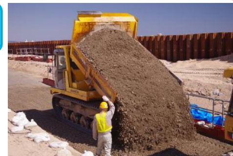
Coastal embankment restoration project in Iwaki city (Started on March 15, 2013)

Major public works using recycled material from debris