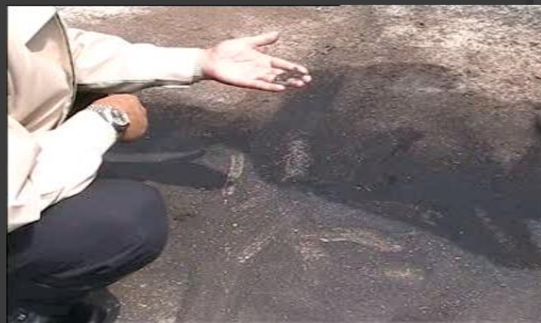
Illegally trafficked waste misrepresented as fertilizer