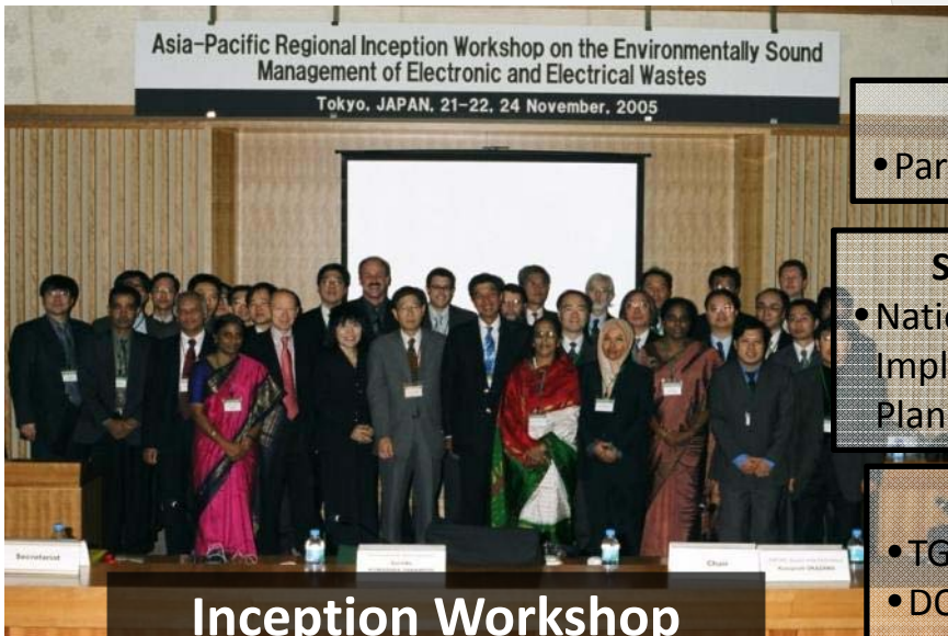
Inception Workshop (Japan 2005)