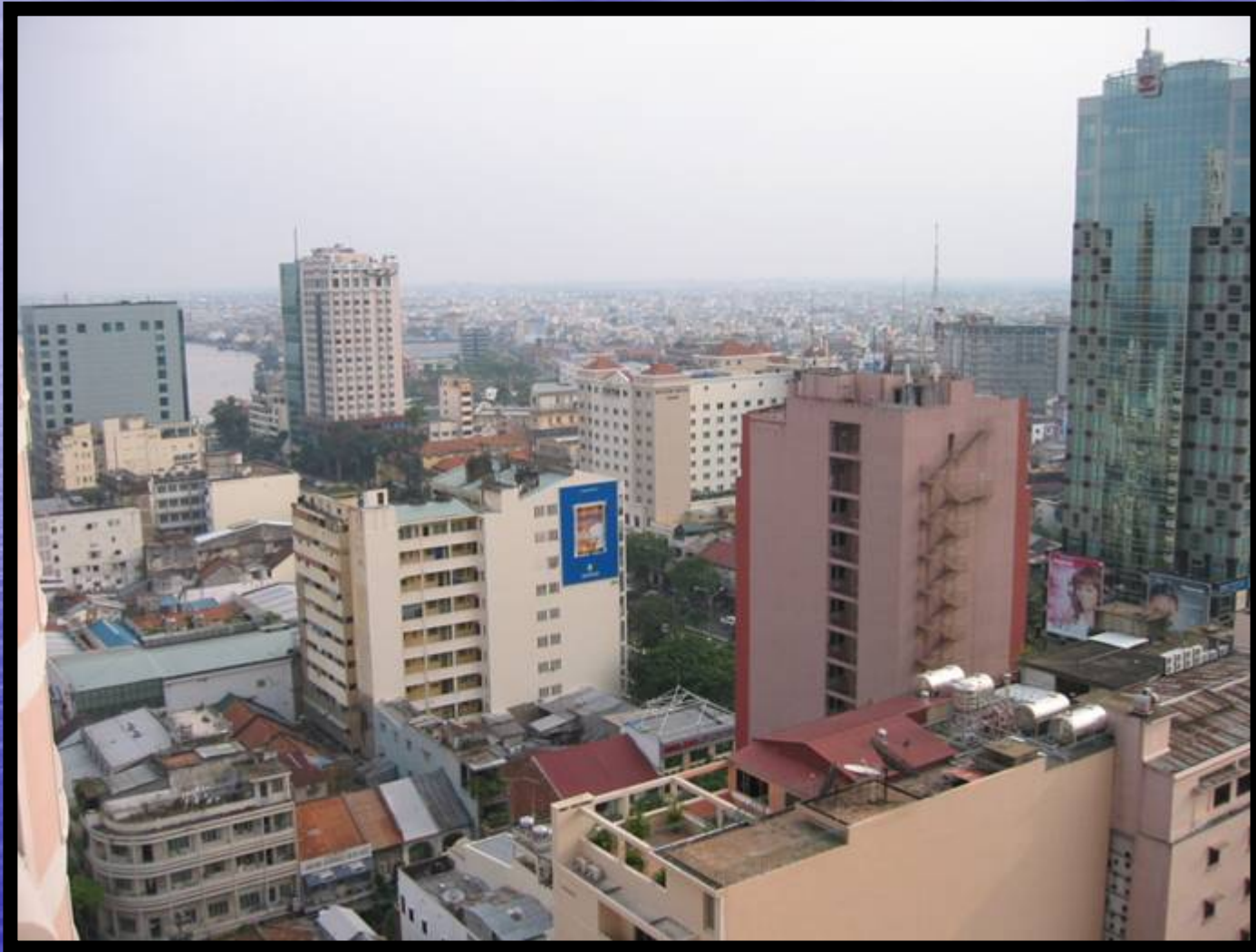
Urbanization in Hochiminh City