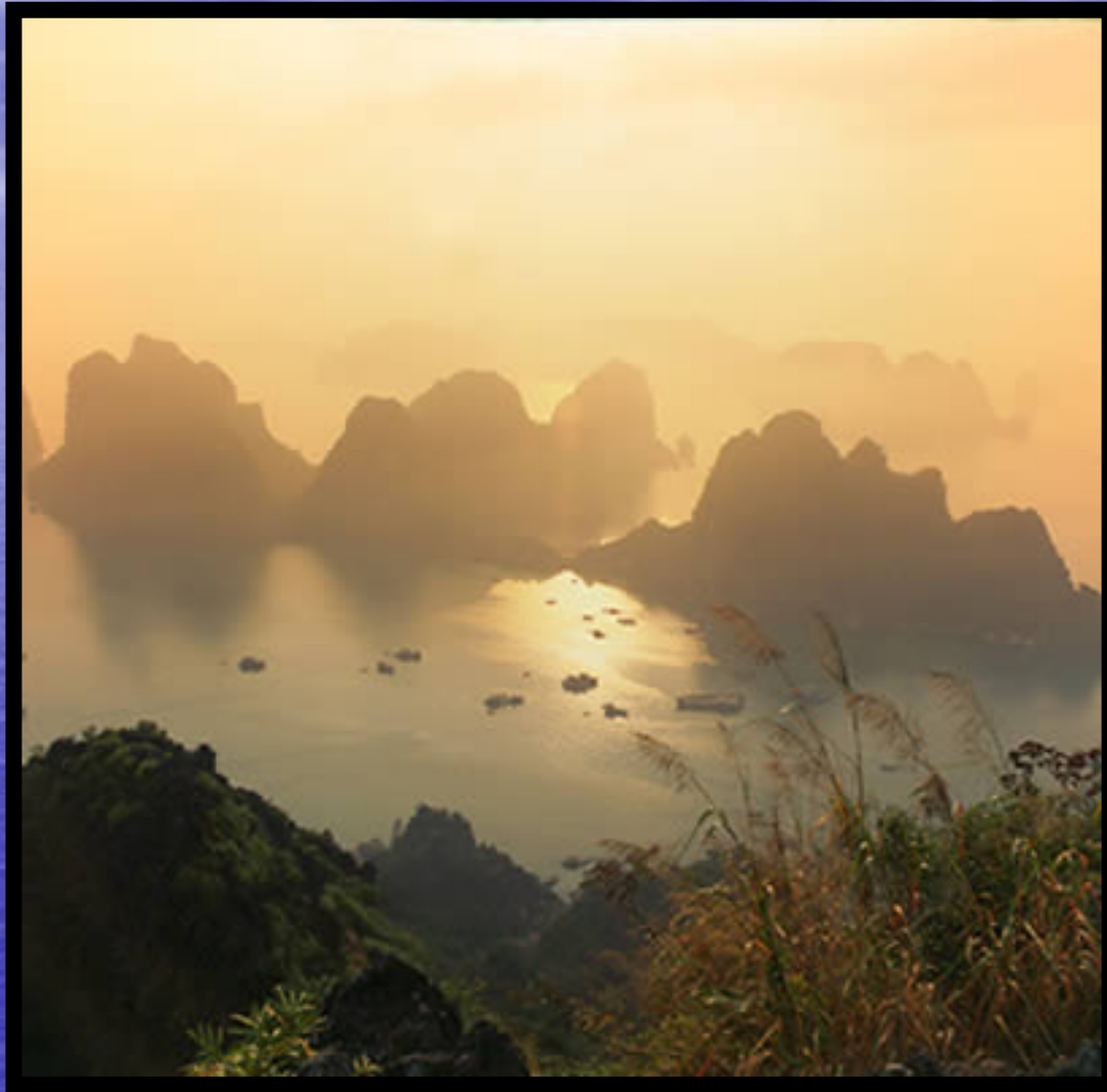
Ha Long Bay