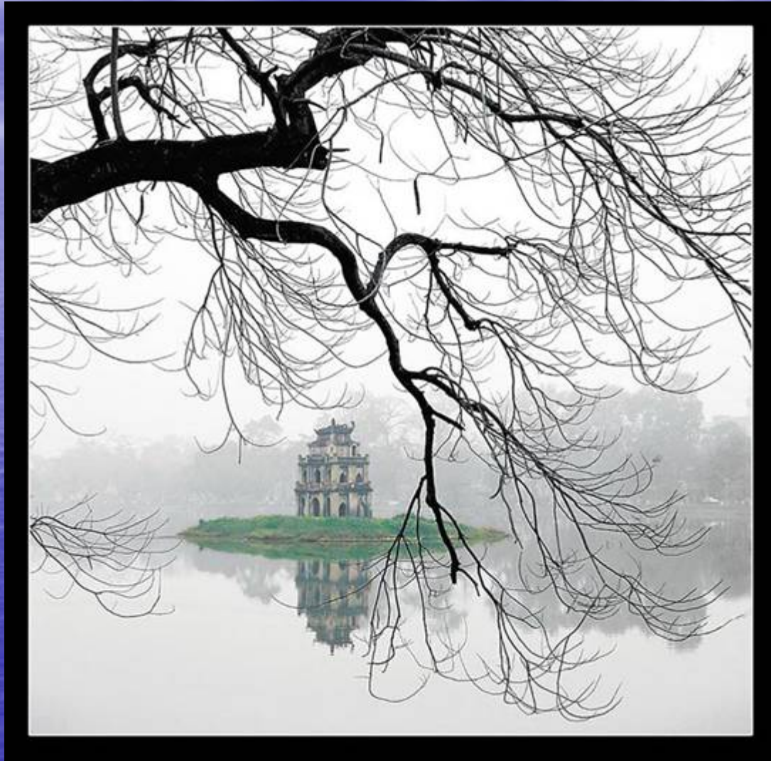
Sword Lake - Hanoi