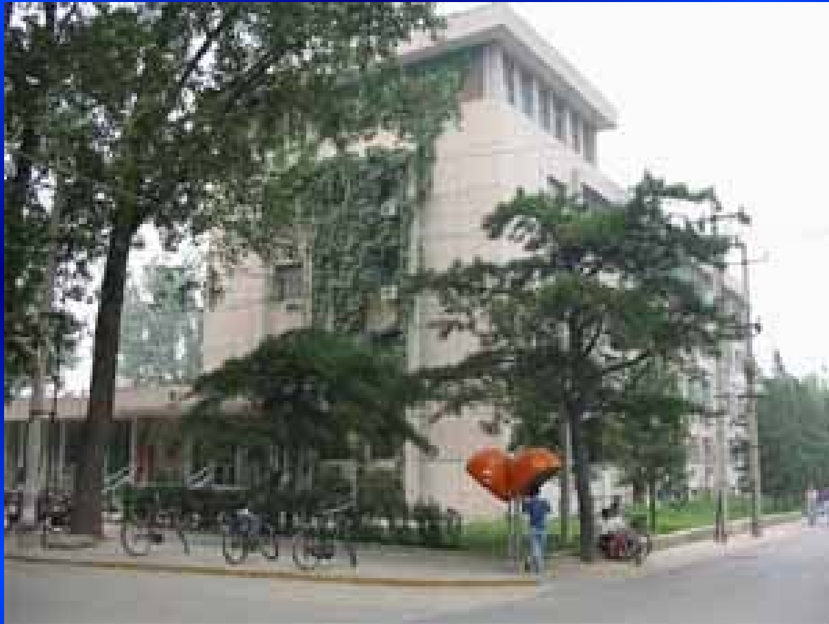
Environmental Building of Tsinghua University