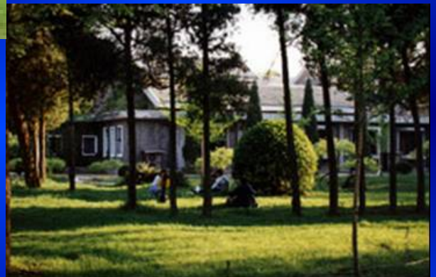
Tsinghua University Guest House