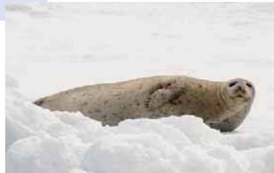
Larga seal Phoca largha