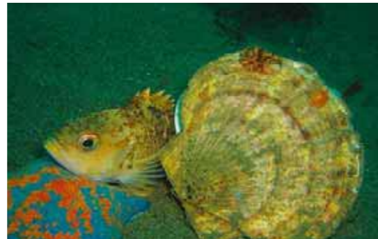
Japanese scallop Patinopecten yessoensis Scopaenidae Sea bat Asterine pectinifera