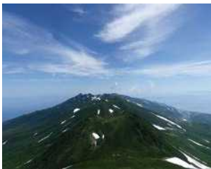
2 Shiretoko National Park