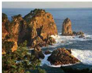
8 Sanriku Fukko (reconstruction) National Park