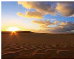
22 San'inikaigan National Park