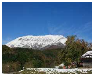
24 Daisen-Oki National Park