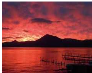
6 Shikotsu-Toya National Park