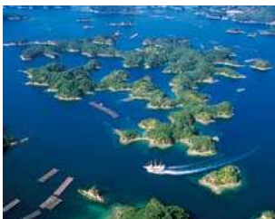
26 Saikai National Park