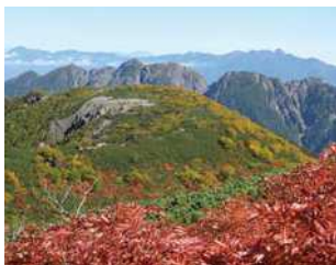
19 Minami Alps National Park