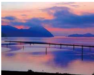
23 Setonaikai National Park