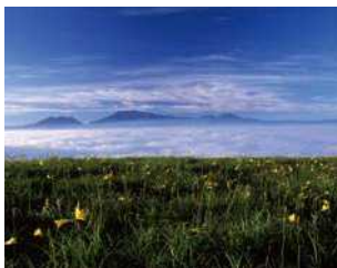
28 Aso-Kuju National Park