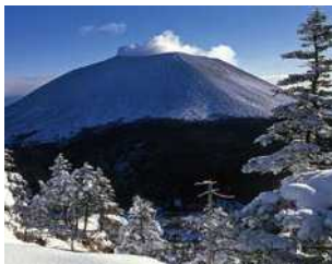
12 Joshin'etsukogen National Park