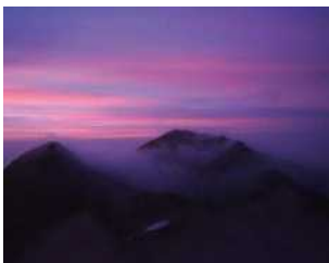
18 Hakusan National Park