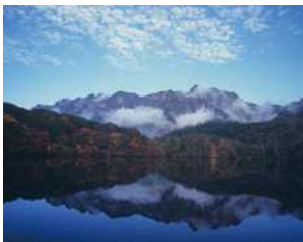
13 Myoko-Togakushi renzan National Park