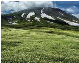
5 Daisetsuzan National Park