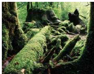
30 Yakushima National Park