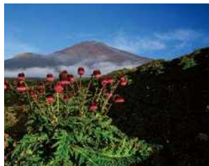
16 Fuji-Hakone-Izu National Park