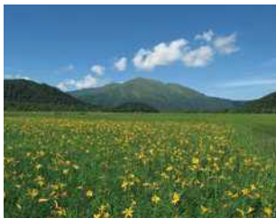
11 Oze National Park