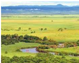
4 Kushiroshitsugen National Park