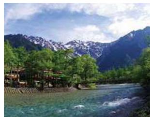
17 Chubusangaku National Park