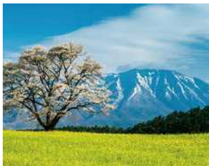
7 Towada-Hachimantai National Park