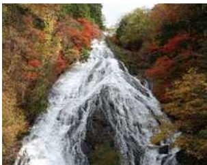
10 Nikko National Park