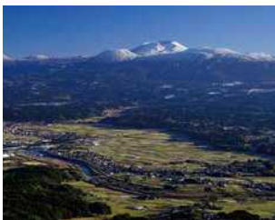
29 Kirishima-Kinkowan National Park