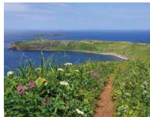
1 Rishiri-Rebun-Sarobetsu National Park

Protecting our natural heritage for future generations