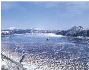
3 Akan National Park