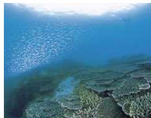
25 Ashizuri-Uwakai National Park