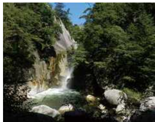
14 Chichibu-Tama-Kai National Park