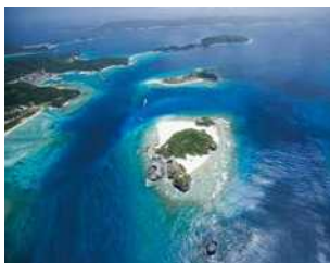
31 Keramashoto National Park