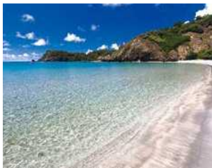
15 Ogasawara National Park