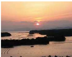
20 Ise-Shima National Park