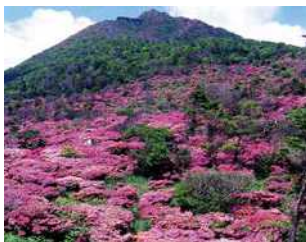
27 Unzen-Amakusa National Park