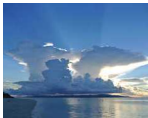
32 Iriomote-Ishigaki National Park

Japan is a land of beautiful natural vistas that can be savored all year round. Fields of alpine flora, serene lakes reflecting the fresh verdure, seas where coral reefs grow and tropical fish swim, island chains in the evening sun, ravines ablaze in crimson foliage, snow-covered lofty peaks, and more are yours to discover.