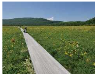
9 Bandai-Asahi National Park