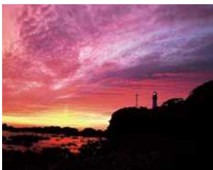
21 Yoshino-Kumano National Park