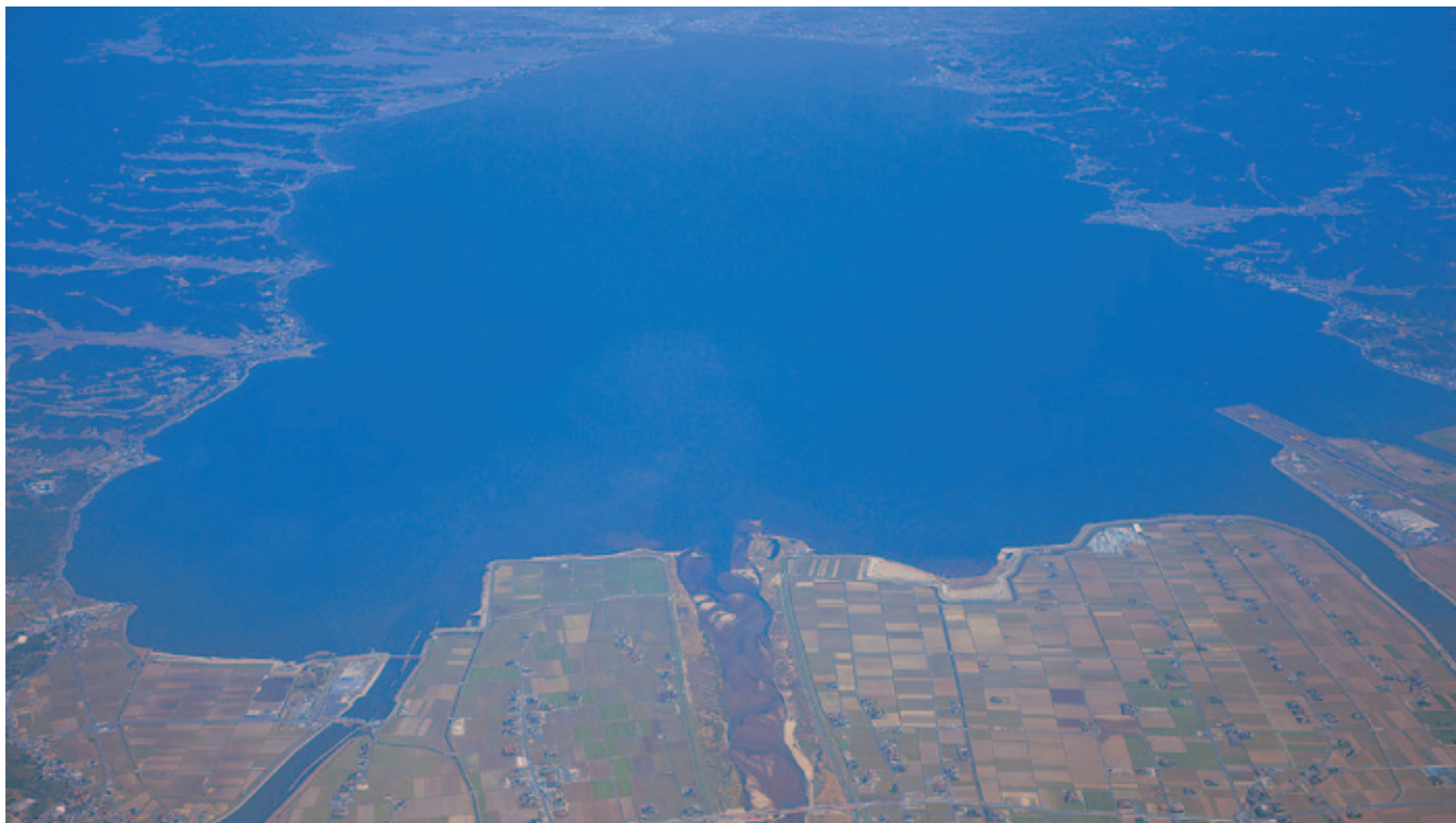
Shinji-ko viewed from the west

Geographical Coordinates: 35°26'N, 132°57'E / Altitude: 0.3m / Area: 7652ha / Major Type of Wetland: Brackish lake / Designation: Special Protection Area of National Wildlife Protection Area / Municipalities Involved: Matsue City and Izumo City, Shimane Prefecture / Ramsar Designation: November 2005 / Ramsar Criteria: 5, 6, 7, 8