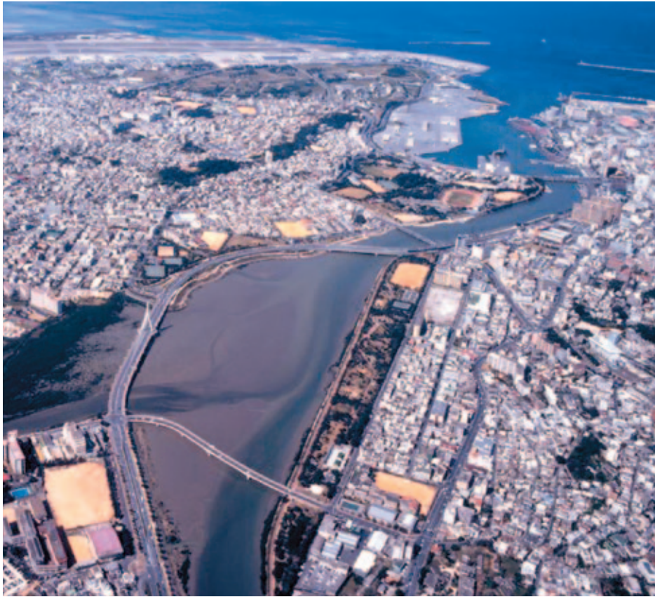
Aerial view of Manko from the east

Geographical Coordinates: 26°11'N, 127°41'E / Altitude: -0.5m / Area: 58ha / Major Type of Wetland: Estuarine tidal flat, mangrove swamp / Designation: Special Protection Area of National Wildlife Protection Area / Municipalities Involved: Tomigusuku City and Naha City, Okinawa Prefecture / Ramsar Designation: May 1999 / Ramsar Criteria: 1, 2, 6