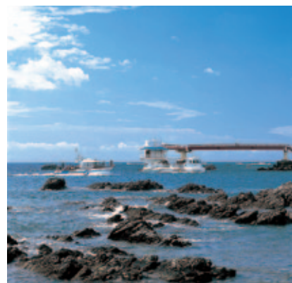
Observatory and excursion boat