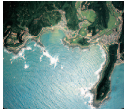
Panoramic view of Sabiura area

[ Catalaphyllia jardinei ] Although it is distributed in the Indian and West Pacific Ocean, this tropical species is a rare and limited species in Japan. The highest concentration of it can be seen in the Tsuyashima area. It is the largest colony of this species in Japan and the northernmost distribution of it in the world. Due to the relatively colder climate, it cannot form a reef.