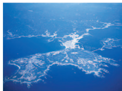
Kushimoto Marine Park