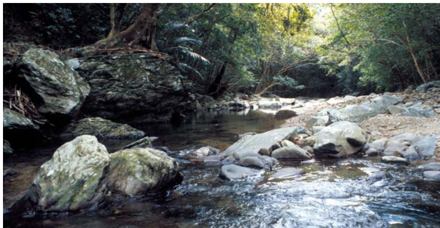
Middle reaches of Shirase River

Geographical Coordinates: 26°22'N, 126°46'E / Altitude: 120-280m / Area: 255ha / Major type of wetland: Permanent and seasonal streams / Designation: Natural Habitat Conservation Area under the Law for the Conservation of Endangered Species of Wild Fauna and Flora / Municipalities involved: Kumejima Town, Okinawa Prefecture / Ramsar designation: October 2008 / Ramsar Criteria: 2