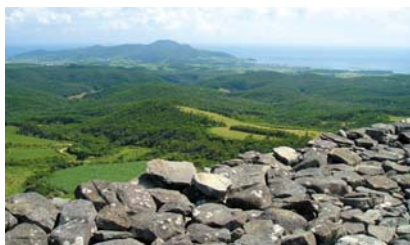
View of the designated area (right hand side) from Uegusukudake

There are two facilities, Kumejima Nature & Culture Center and Kumejima Firefly Museum, for conservation management and public awareness.