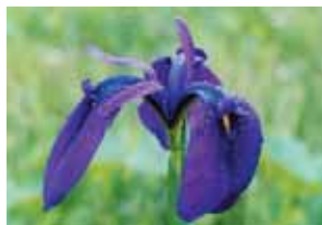
Iris ensata var. spontanea

canda chinensis are in full bloom. In July, the marshland is blanketed with orange broad dwarf day-lily Hemerocallis dumortieri . The annual broad dwarf day-lily Festival attracts a large number of visitors from all over the country.