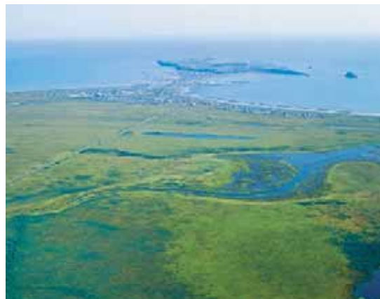
Aerial view of Kiritappu-shitsugen

A variety of ecotourism activities are offered by a local fishery cooperative,