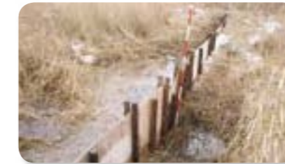
Immediately after damming, at the outflow of Ochiai-numa Pond (the dike is 10.5-m long and 1.1-m high above the ditch bottom).

A wetland was sealed by dike construction along existing ditches to reduce water drainage, in order to prevent further desiccation. Groundwater tables and vegetation are being monitored.