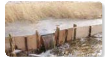
Two days later after damming. A large amount of overflow was generated by snowmelt flow.