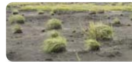
A close look of the mined peatland