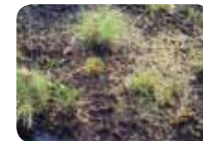
Sundew ( Drosera anglica ) growing on a floating peat

Natural re-vegetation has been observed in old mined peatlands, exhibiting a near raised-bog appearance with sphagnum moss cover that has developed over time. However, many of the other mined areas retain large open water and poor vegetation. Specific methods for rehabilitating or creating historical vegetation are being developed.