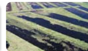
An abandoned mined peatland