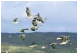
Bean goose ( Anser fabalis )