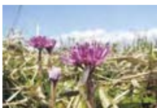
Japanese hyacinth ( Heloniopsis orientalis )

Sarobetsu Mire, originally a lagoon (Old Sarobetsu Lake) bounded by coastal sand dunes and Soya Hills, was formed by peat accumulation and the inflow of Old Teshio River and its tributaries. The Mire now develops the largest lowland raised bog in Japan. It is a unique ecosystem with various features: the expansive bog of Sphagnum moss and wild cranberry ( Vaccinium oxycoccos ); habitat for a species symbolizing the zoogeographic boundary between Sakhalin and Hokkaido, the viviparous lizard ( Lacerta vivipara ); staging sites for migratory birds; and