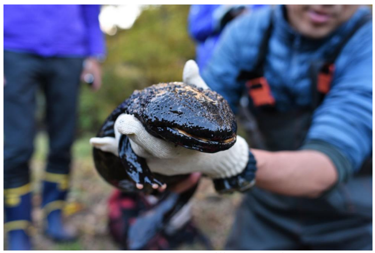
Japanese Giant Salamander