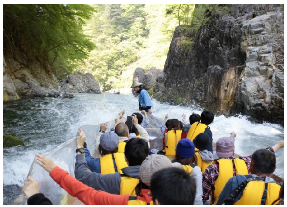
Kinugawa River Cruise

Available: All year Contact: Kinukougenkaihatsu Co., Ltd. Phone: 0288-77-0531