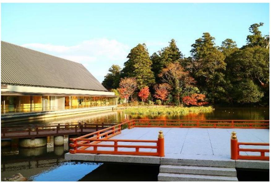
Ise Grand Shrine