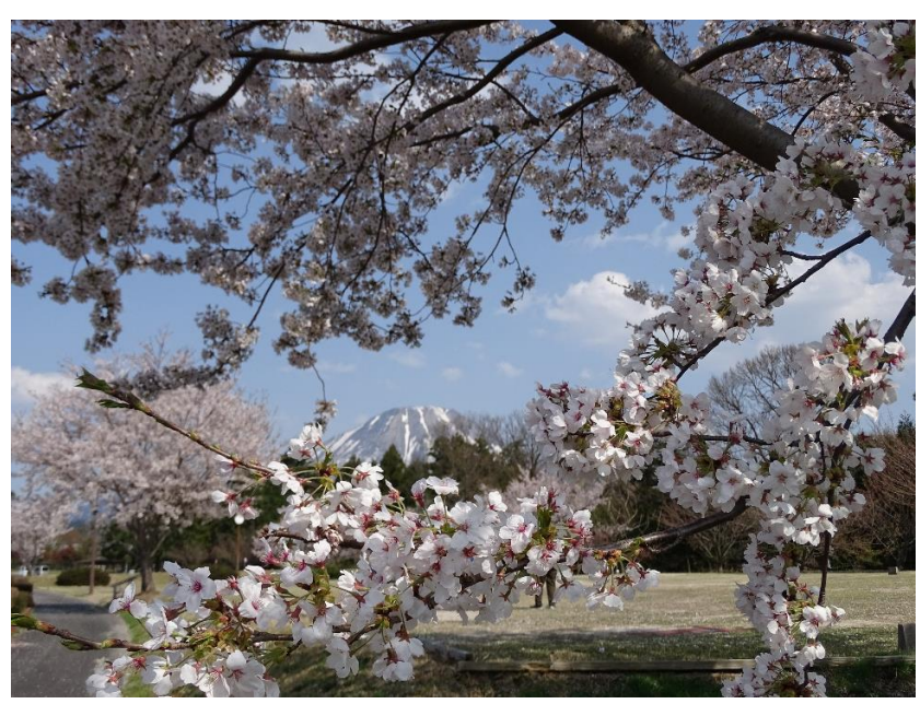
Cherry Blossoms against Mt. Daisen

From the month of April, a multitude of experiences become available to enjoy. Hikers and climbers will enjoy the lush greenery and vibrant colors of the blooming flowers. There is everything for nature lovers, sport activity enthusiasts, and those who want to absorb a different culture, can find it at Daisen-Oki.