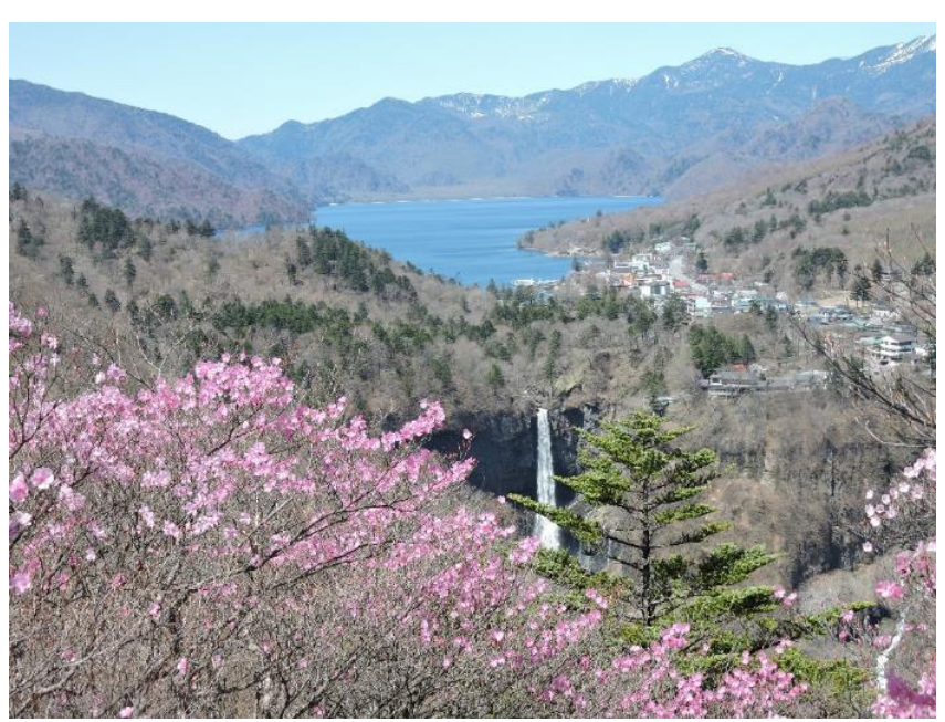
Lake Chuzenji and Kegonnotaki Waterfall

Nikko, Okunikko, and Nasu are filled with such a variety of places to visit, and experiences to be had. The easy access from Tokyo makes the area an ideal location to visit just for a day's trip to get away and leave the stress of hectic city life behind. Slow relaxing walks in forests that are just coming back to life from the winter, or enjoy an exhilarating river cruise ride down Kinugawa River, or explore the back streets of Nishimachi discover the amazing shops and cafes.