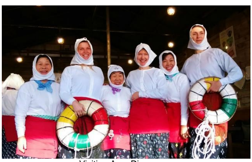
Visiting Ama Divers