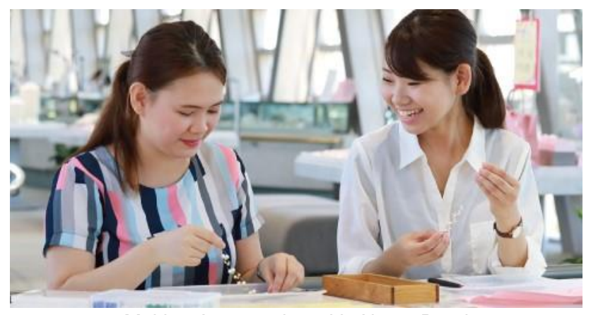
Making Accessories with Akoya Pearls

Try your hand at making accessories using Akoya pearls, while learning of its history. Available: All year Contact: Pearl Falco Phone: 0596-23-2988 or visit; <a href="www.p-falco.com/en/">www.p-falco.com/en/</a>