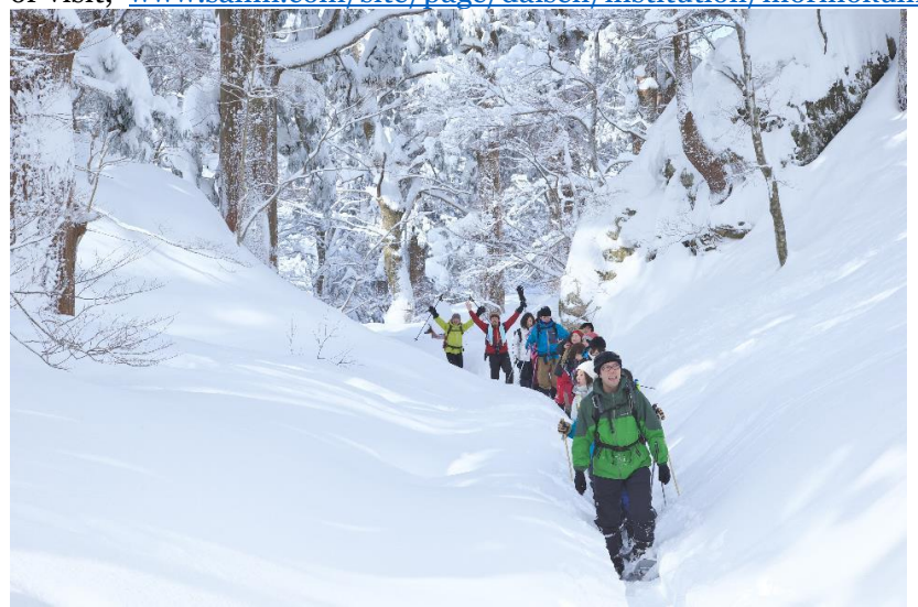
Daisen Snowshoe Tour

The beech forests surrounding Daisenji Temple have changed very little since the temple was officially opened 1300 years ago. This tour provides sights such as the panorama from Mt. Daisen's summit, travel through the snowy fields and snow-encrusted trees. Featuring temples and shrines that only the locals know of. A winter only experience. Contact: Morinokuni Phone: 0859-53-8036 or visit; www.sanin.com/site/page/daisen/institution/morinokuni2/ready/english