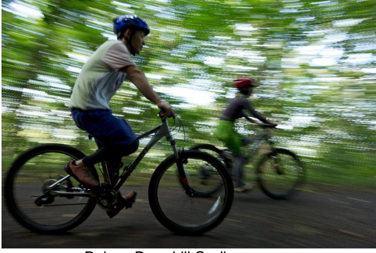
Daisen Downhill Cycling

Available: April - November Contact: Morinokuni Phone: 0859-53-8036