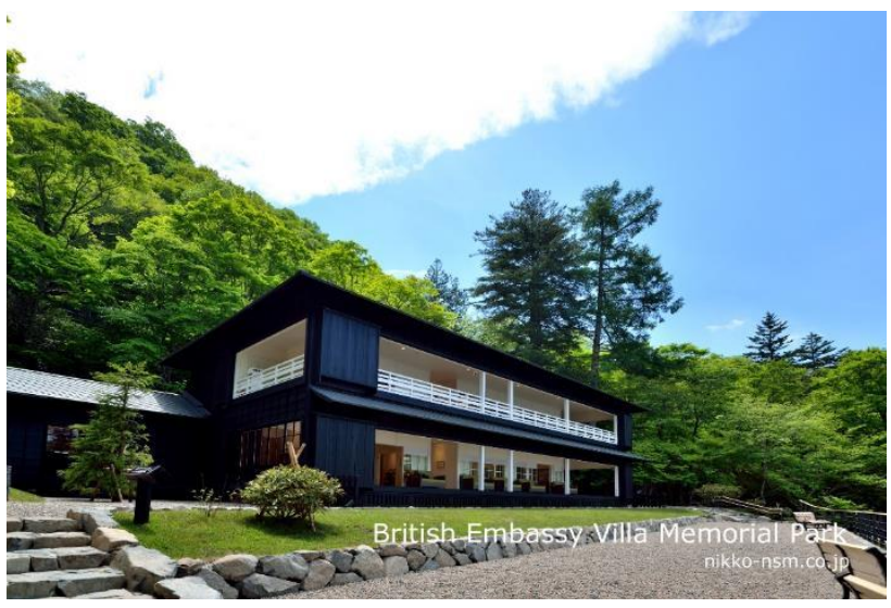
British Embassy Villa - Lake Chuzenji

Open from: April – November Contact: Nikko Natural Science Museum Phone: 0288-55-0880