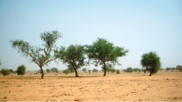
Burkina Faso, Africa

Dryland which are vulnerable to desertification occupy 41% of Earth's land area and are home to more than 2 billion people, at least 90% of whom lives in developing countries. Desertification often causes poverty, food insecurity and water scarcity.