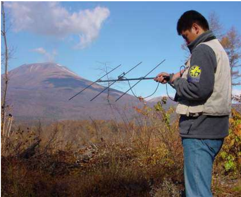
Location (checking whereabouts)