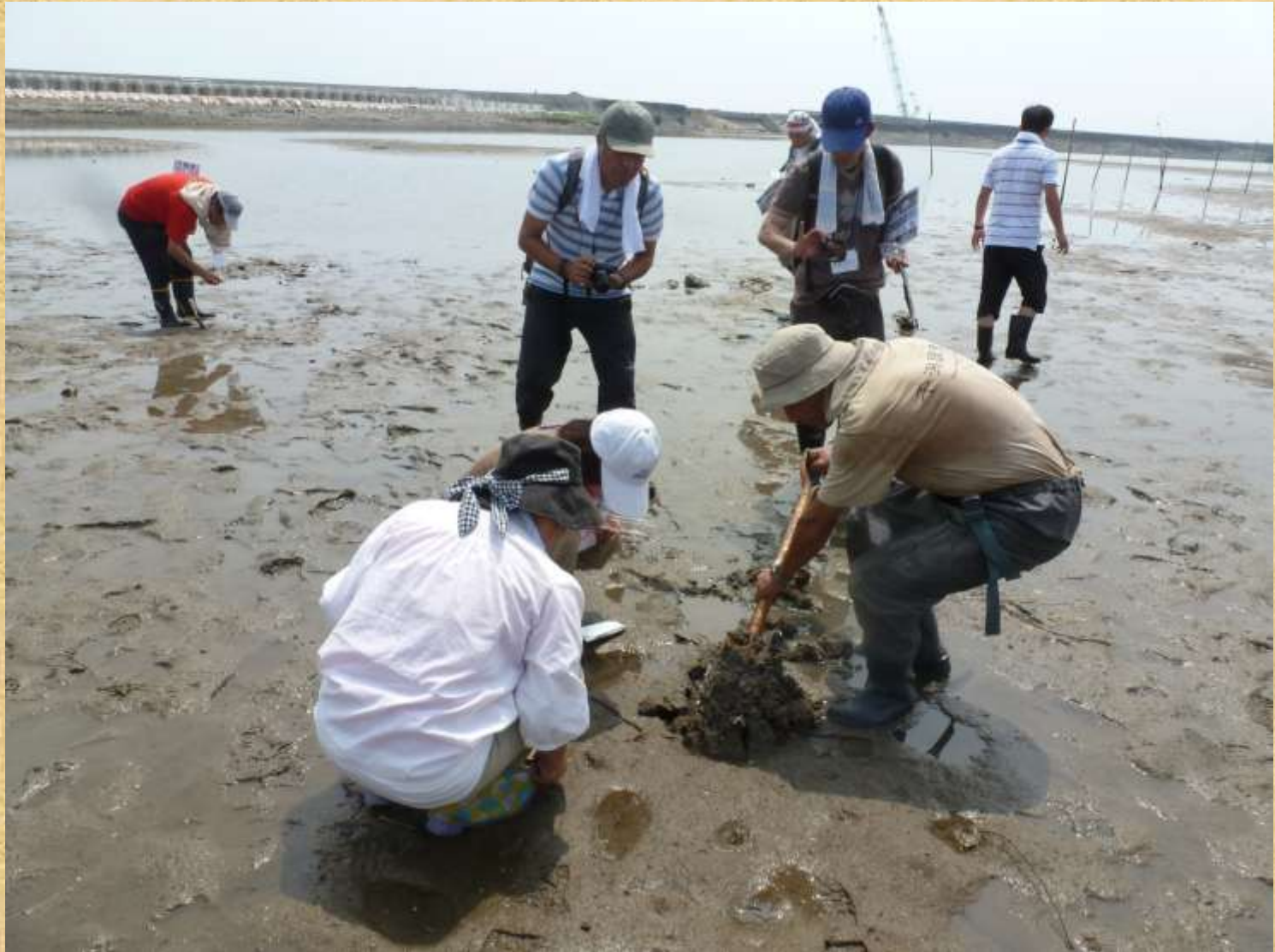
August 2013 Matsukawaura, Soma City