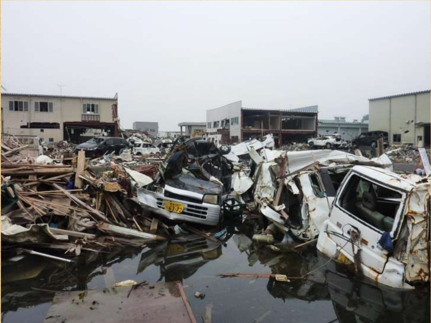
June 2011 Kesenuma port