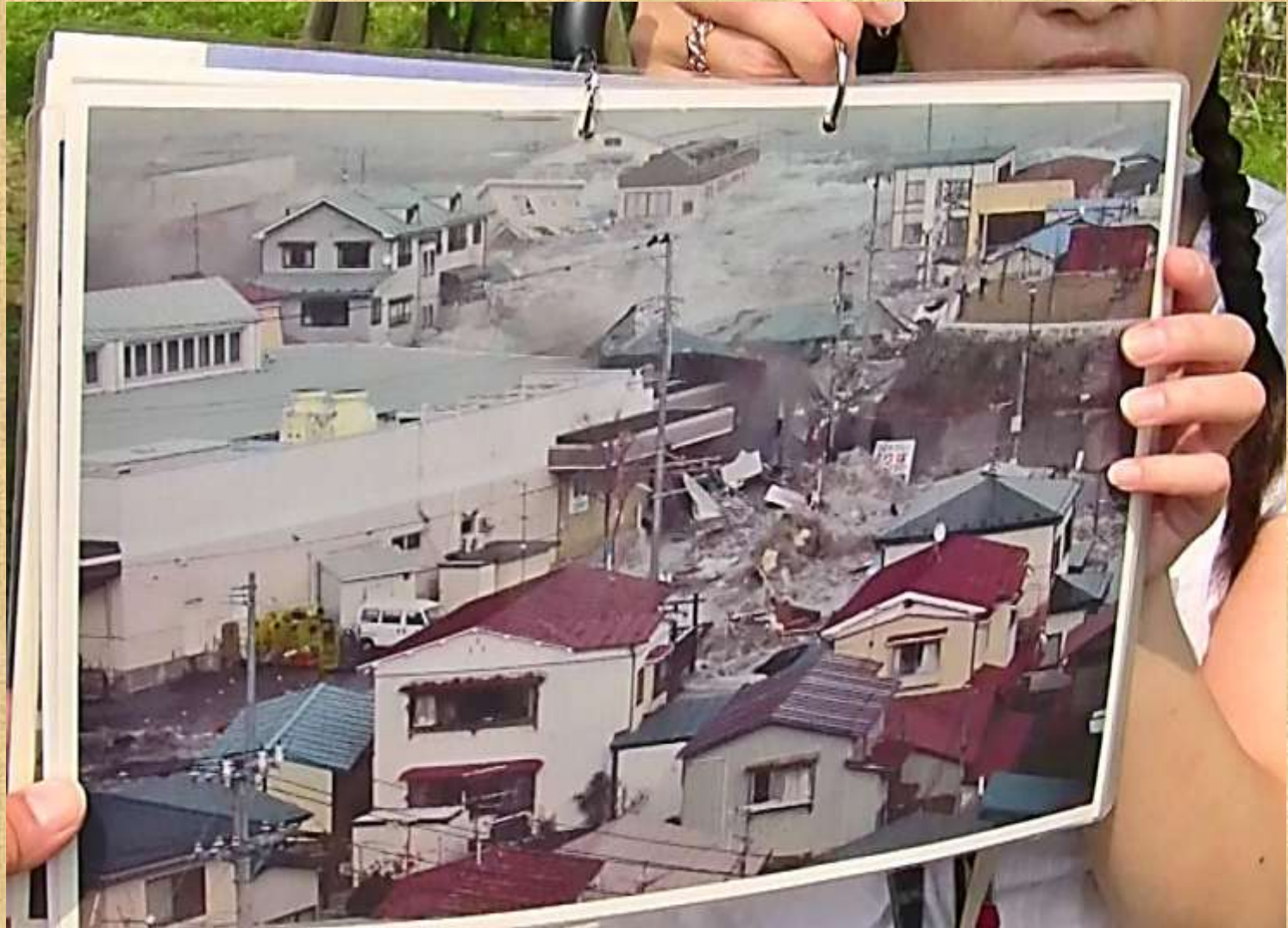
August 2013 Yamada town