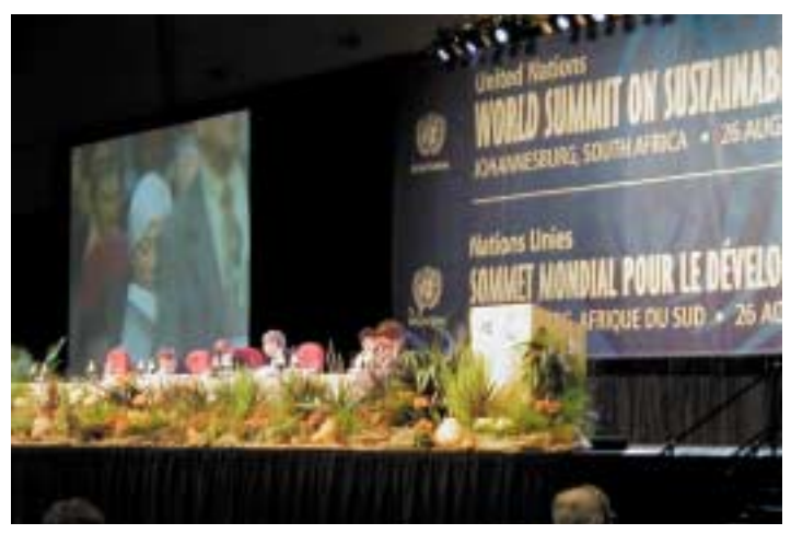
Sandton Convention Centre, Johannesburg.

In addition, the "Koizumi Initiative," announced by Prime Minister Koizumi, was highly praised by other countries. Its main pillars are "human resources development," as well as "ownership and solidarity."