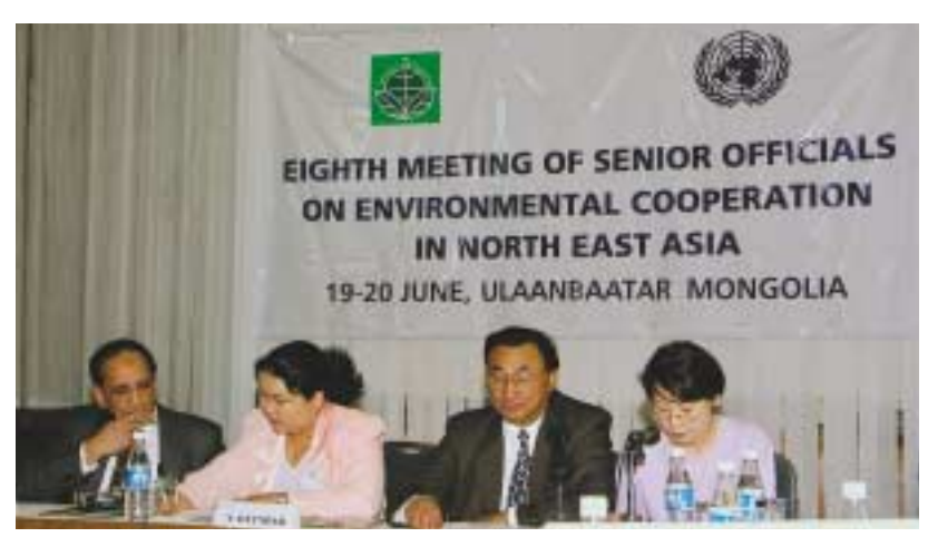
The Eighth Meeting of Senior Officials on Environmental Cooperation in North-East Asia.

The next meeting will be held in Russia in 2003.