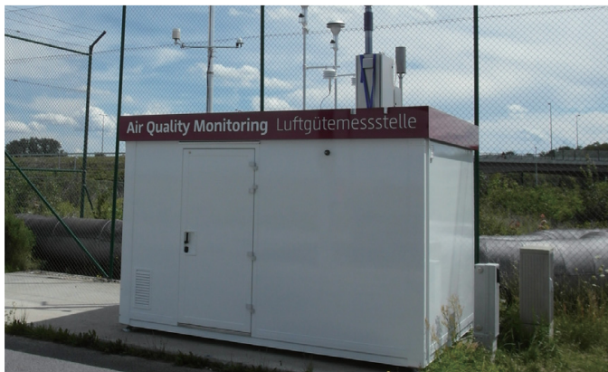
The air quality monitoring station in Berlin Brandenburg Airport This system includes our ambient monitoring analyzer, meteorograph and data logger.

In order to meet the needs for the atmospheric monitoring, we provide additional equipment such as the shelter for the monitoring station and relevant services such as sampling and data processing.