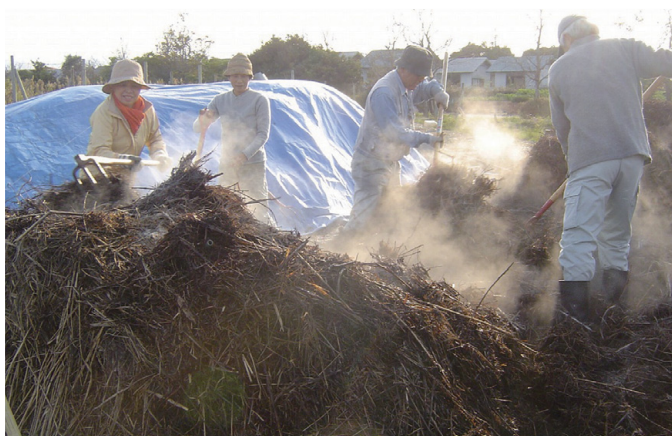
Spreading the composting technology with a history of 50 years to Asia

We establish composting technologies including the one called cardboard box composting that can compost organic waste such as kitchen waste, fallen leaves, lawn waste and seaweed without using electricity, and we spread our technologies over Asian countries by educating people.