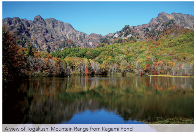
A view of Togakushi Mountain Range from Kagami Pond

Myoko Togakushi Renzan National Park was born on 27 March 2015 as the 32nd national park in Japan. The park is located in the skirts of the mountains on the border of Niigata prefecture and Nagano prefecture stretching from 500m to 2,400m in elevation.