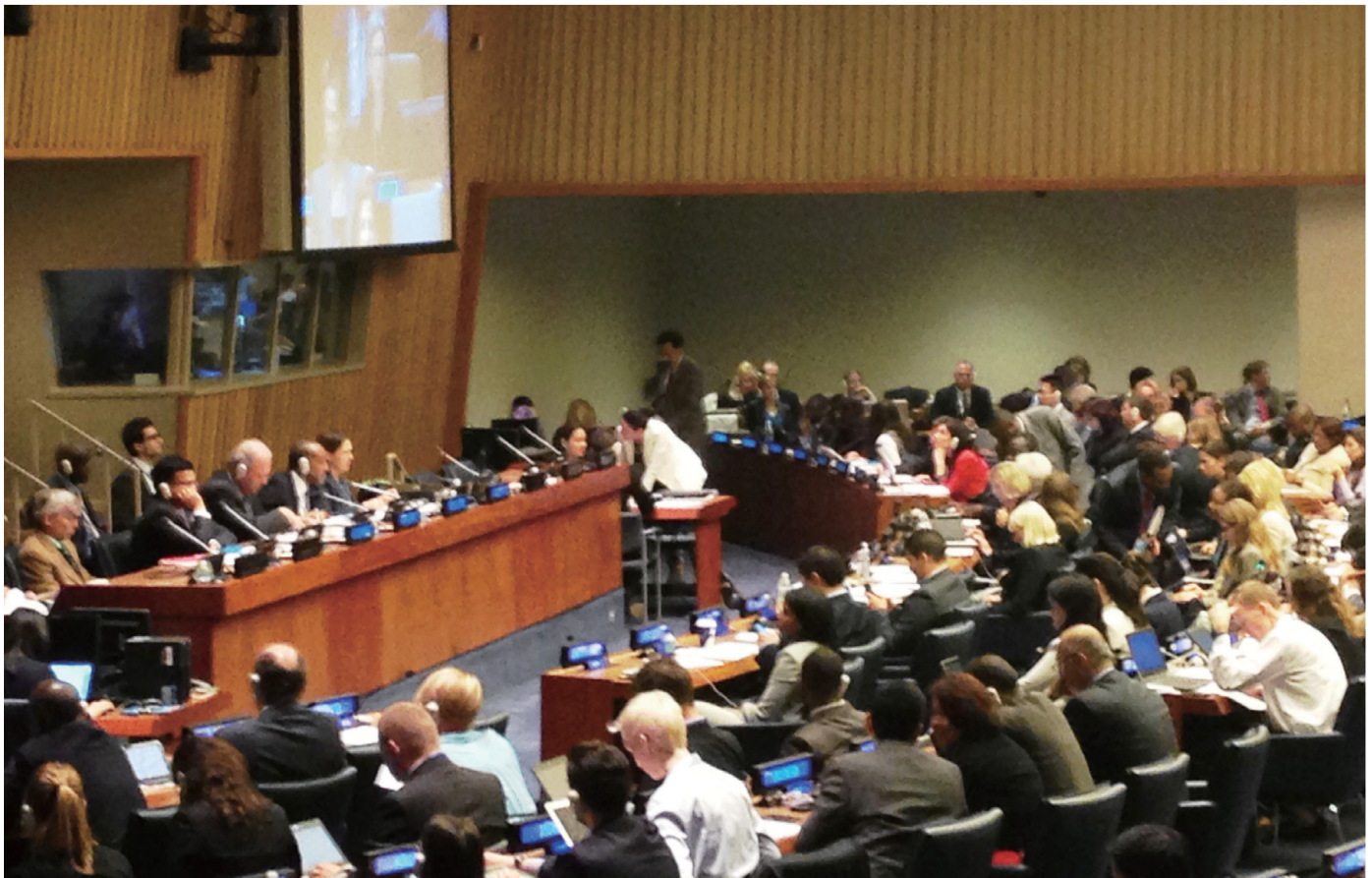
The Post-2015 Intergovernmental Negotiations (Follow-Up and Review) in New York, USA, May 18-22, 2015.

2015 is a very important year for mankind to take a new step towards a sustainable society. Specifically, Post-2015 Development Agenda, a set of new global development objectives after 2015, will be adopted in September 2015, so that animated discussions are taking place at UN intergovernmental negotiation conferences. MOEJ has contributed to such intergovernmental negotiations. In addition, Japanese high officials have actively participated in various UN conferences on the sustainable development in order to have talks with pivotal persons and to form the networks with other countries. The core of the Agenda is the Sustainable Development Goals