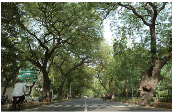
Roadside trees in the centre of Delhi

While commuting every morning in Delhi, I enjoy going through beautiful roadside trees. Delhi has the largest forest cover among major cities of India and you can find a number of forest areas. Tree functions as an air purifier, as well as a shelter from the strong