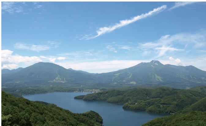
The panoramic view of Nojiri Lake and Kurohime Mountain (left) and Myoko Mountain (right)