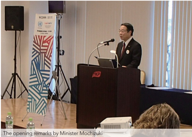
The opening remarks by Minister Mochizuki

The Ministry of the Environment, Japan (MOEJ), the United Nations University (UNU) and the International Union for Conservation of Nature (IUCN) co-hosted the Public Forum Side Event “Mainstreaming Ecosystem-based Disaster Risk Reduction and Reconstruction” on the first day of WCDRR held in Sendai City, Japan from March 14th to 18th. Over 200 participants from home and abroad attended the event.