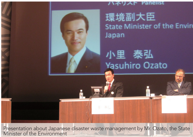
Presentation about Japanese disaster waste management by Mr. Ozato, the State Minister of the Environment

The Third UN World Conference on Disaster Risk Reduction/Great East Japan Earthquake Forum