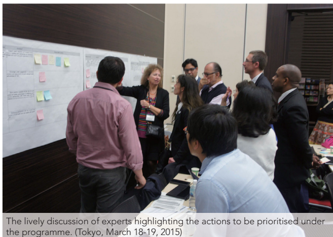
The lively discussion of experts highlighting the actions to be prioritised under the programme. (Tokyo, March 18-19, 2015)

Tokyo Was Once Again the Centre of Planning for International Actions to Promote Well-being of Society and Its Citizens