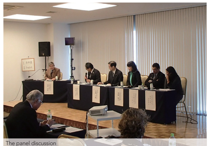
The panel discussion