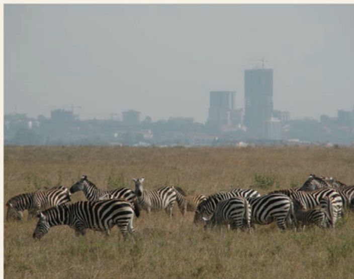
A view of Nairobi City from the Nairobi National Park

Nairobi is an interesting city. Nearby this large city with a population over three million, there lies a National Park with its extensive savanna ecosystem. The scenery in which giraffes and zebras leisurely stride against the background of lofty buildings is uniquely Nairobi. Located here is the head office of the UN Environmental Programme (UNEP), in which many international meetings are held every year.