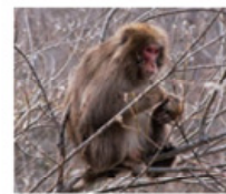
Japanese monkey (domestic species)