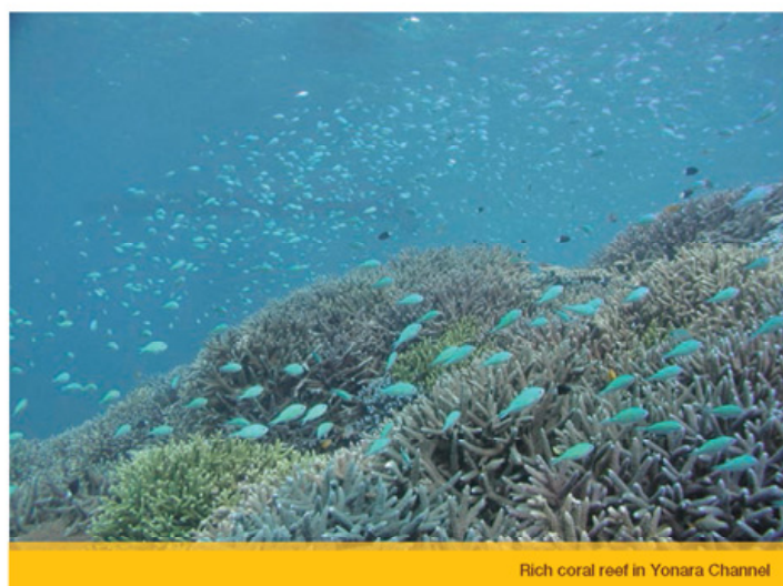
Rich coral reef in Yonara Channel

On 29-30 June 2013, the “International Conference on Climate Change and Coral Reef Conservation” (hosted by Ministry of the Environment and Okinawa Prefecture) was held at the Okinawa Institute of Science and Technology Graduate University (OIST). Relevant knowledge was shared and opinions were exchanged at the Conference with the participation of government officials and experts from 14 countries and regions, including Minister of the Environment of Japan, Mr. Ishihara, and Minister of the Environment and Energy of Maldives, and Minister of the Finance of Palau, and the IPCC Chairman, Dr. Pachauri, and experts in a broad range of fields such as global warming countermeasures and coral reef conservation in island countries. At the Conference, the plenary session, four section meetings and side events were held during the two days. Minister Ishihara started the session by announcing the “Comprehensive Environmental Support for Island Countries”, followed by broad discussions on ecotourism and adaptation measures to climate change, and finally the confirmation that Japan and other island countries will continue the Okinawa-based cooperation and discussion.