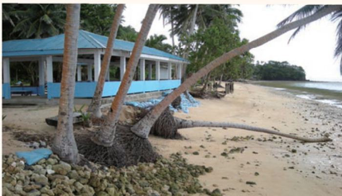
Shore erosion by a typhoon and its recovery status (Palau)

In this study, we aim to establish a low-carbon model integrating both adaptation and mitigation measures in island countries where adaptation tends to be focused on than mitigation. In the model, we will consider the whole concept of a highly feasible business scheme by combining advanced Japanese technologies in the fields of disaster prevention and infrastructure for adaptation, and renewable energy (e.g., solar power) generation for mitigation.