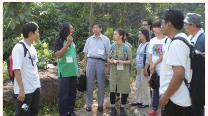
Field tour during the international ESD workshop in Surabaya