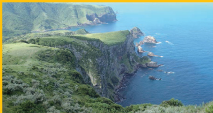
A view of the Kuniga Seaside in Nishinoshima Island

Oki Islands Geopark was added to Global Geoparks Network in September 2013, which is thus expected to increase visitors from inside and outside Japan in the future. In this regard, it has been decided that a Ranger Office for Nature Conservation will be newly established in Oki islands in October, and thus rangers for nature conservation of the