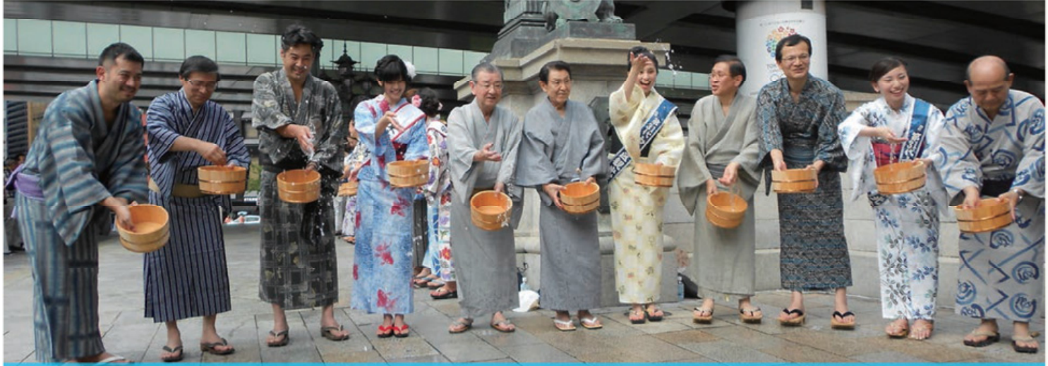
“Uchimizu” : a custom of cooling down with evaporation effect of sprinkled water

Global warming countermeasures in each area of the world may vary depending where the four seasons are clearly defined, there are two countermeasures “WARM BIZ” against cold winter. Please try to consider what can be global warming