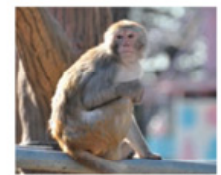
Rhesus monkey (IAS)