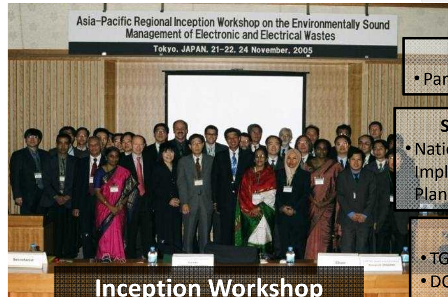
Inception Workshop (Japan 2005)