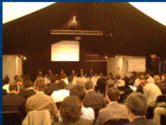
WSSD Parallel Event on APFED Message to WSSD