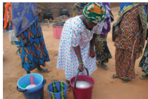
Soap making group

[Comment] Representatives from each district attend a general assembly and are responsible for passing on the results of discussion at the district meetings. Selection of the representatives for the meetings and study visits was done fairly, based on criteria of honest and responsible character, and ability to explain details clearly. Among the women, also, suitable people were nominated, the decision-making process therefore, was felt to be rational.