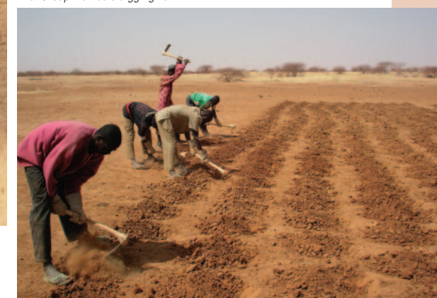
Trial Group members digging Zai