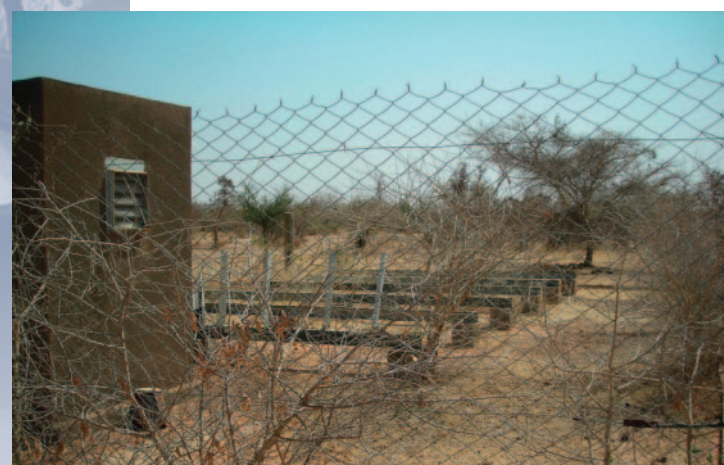
Stolen solar panels

This example reveals that when technologies developed in developed countries are transferred to arid areas of developing