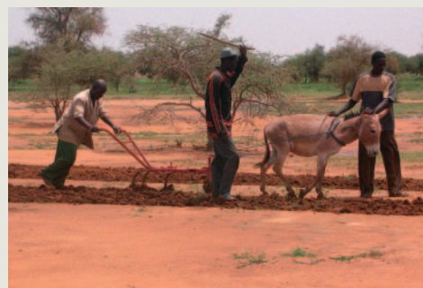
Training of cultivation methods

During this project, at workshops and the planning stage, villagers were told that the transfer and promotion of technology should be done without spending much money, and by making the most of their local resources. Evidence of improvement in equipment procurement, etc. was already appeared in the trial group activities.