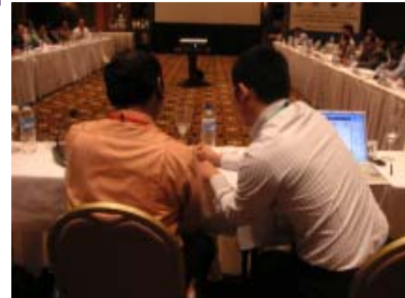
Bilateral talk... 9 ?