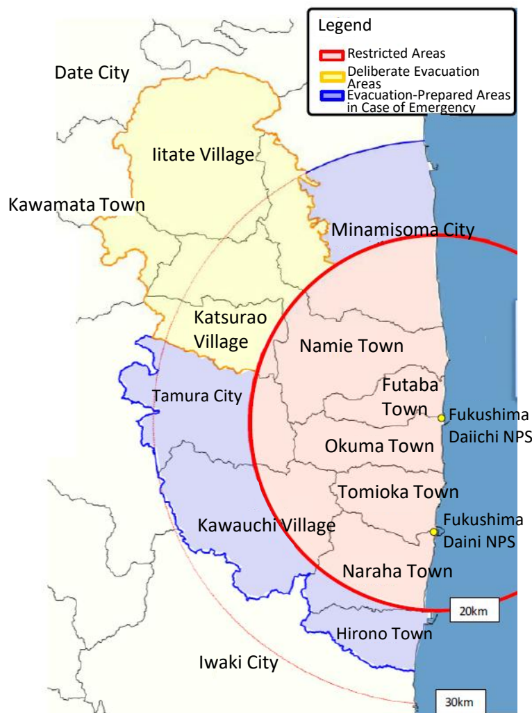
As of April 22, 2011 (when the designation of areas immediately after the accident was completed)

Prepared based on the 15th meeting of the Nuclear Emergency Response Headquarters (May 17, 2011) and the 31st meeting of the Nuclear Emergency Response Headquarters (August 7, 2013), etc.