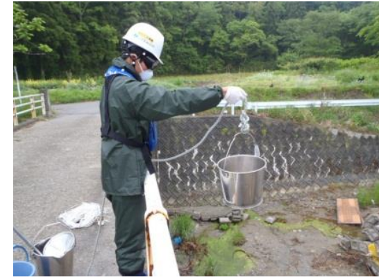
(River: water sampling)

Twice to 10 times a year depending on the contamination status, etc.