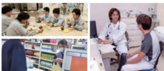
The large rest house has a dining room and a convenience store.