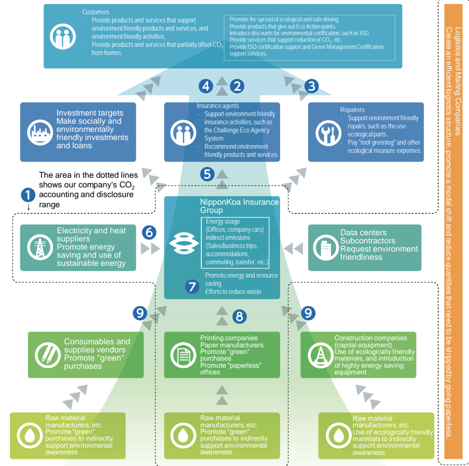
Overall Image of Environmental Load from Business Activities (Upstream to Downstream) and Our Group's Environmental Preservation Efforts