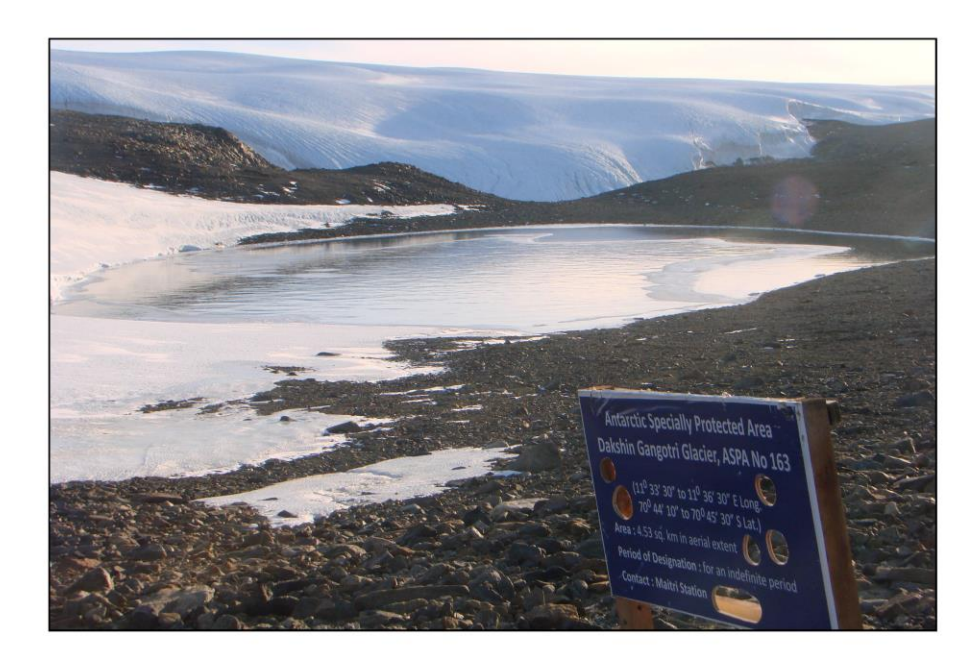
Figure 1: Images of Secured Markers at two Locations at the Boundary of ASPA-163