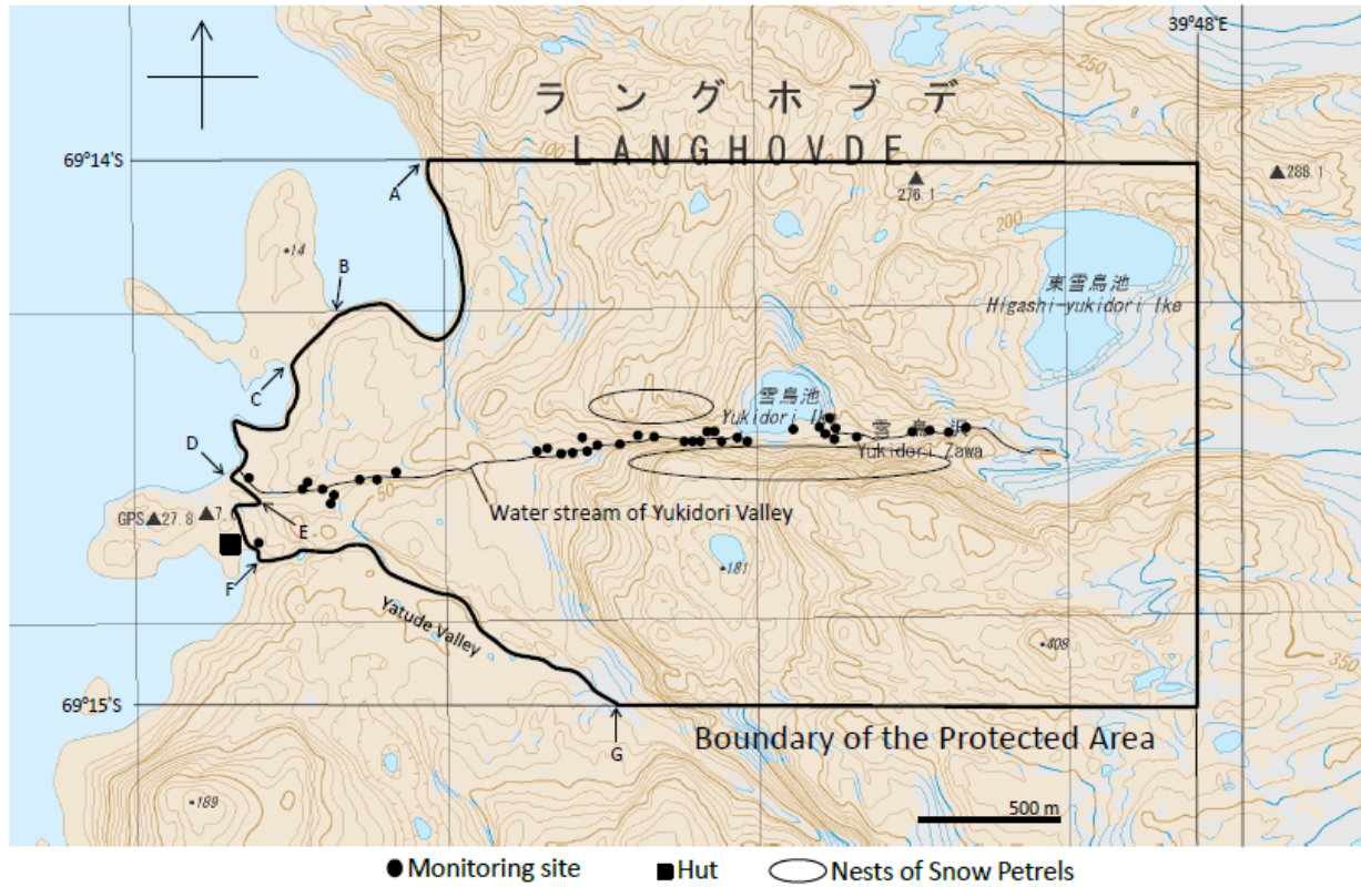
Map 2. Yukidori Zawa Valley, Langhovde and the boundary of the Protected Area. Universal Transverse Mercator projection. Spheroid and Datum: WGS84.