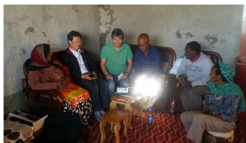
Brightness for Local Community (Ethiopia)