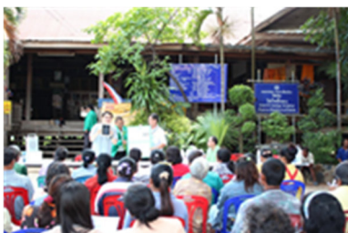
Explanation of products (Thailand)

Sampo Insurance (Thailand) Public Company Limited offers weather index insurance to borrowers of Bank for Agriculture and Agricultural Cooperatives of Thailand (BAAC). Weather index insurance has since then widely been accepted by Thai farmers and the product's sales area has expanded from initial one province in Northeast Thailand to currently twenty provinces across Northeast Thailand. In 2014, "Weather Index Insurance" was developed for the Philippines in addition to Myanmar. A similar product is also currently underway in Indonesia.