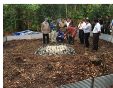
Briefing on the project to Local Affiliates