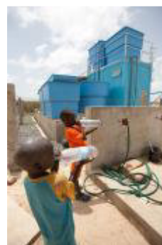
Children gulping Clean Water (Senegal)