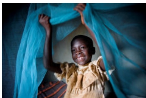
Child playing with “Olyset® Net”

Sumitomo Chemical provides “Olyset® Net” for regions where there are fears of an increase in infectious diseases transmitted by mosquitoes as a result of expansion in mosquito breeding areas due to climate change. The Company started local production in September 2003 through a grant of manufacturing technology to A to Z Textile Mills Limited in Tanzania. To meet surging demand, “Olyset® Net” Production Company was set up as a joint venture with A to Z Textile Mills Limited, through which as many as 7,000 job opportunities were generated and the regional economy was boosted. In 2010, the Company built a production framework that, combined with Asian production bases, is aggregately capable of manufacturing as many as 60 million units annually. The products are now supplied to more than 80 countries through such international organizations as The Global Fund and UNICEF. Furthermore, the Company has launched sales to general consumers through local supermarkets in Kenya and several countries in Asia since 2011 to develop diverse sales channels.