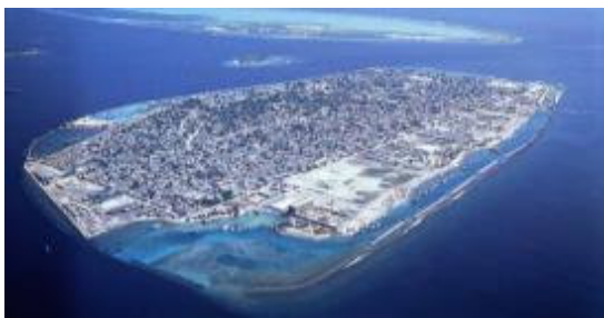
Bird's-eye view of Male Island

Male Island, the Capital of Maldives has been repeatedly hit by high tides due to flat landscape which is only 1.5 meters above sea level. Unusually high tides in 1987 and 1988 wrecked existing seawall structures and residences, paralyzed government operations and the total damage was worth 6 million US dollars. The Island was also at the brink of submersion due to the sea level rise associated with global warming. The Japanese government offered grant aid to support the construction of seawall. Taisei Corporation took on the construction of breakwater along the south coast of Male Island in 1987, and built the 6 kilometers seawall around the Island. The Maldives is heavily dependent on the import of construction materials and much of the concrete aggregate was delivered from neighboring Malaysia and Singapore. Water for construction and domestic use by workers came from desalinated sea water. To conserve natural environment from adverse effects of construction, the Company set out self-disciplinary principles and refrained from coral stone mining. All such efforts bore fruit at the time of major earthquake off Sumatra in December 2004 when the Island had no human casualty and very little collateral damage which significantly contributed to saving human life and maintaining key government functions.