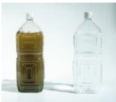
Water Purification (Before & After)

The System has been introduced to medical and educational facilities and rural areas in countries vulnerable to water pollution such as Indonesia, Vietnam, Senegal and Mauritania, drastically reducing the outbreak of diarrhea, fever and other illnesses. The System has also transformed people’s lives. Local residents are now released from the chore of pumping water from the well and they have shifted themselves to production and learning activities. Economic development in rural areas and villages has also been achieved through new businesses such as water delivery, flush cleaning and ice making. Eying the System as a contributor to social infrastructure development while enhancing corporate awareness at the same time, Yamaha Motor is actively introducing the System to areas with water supply but without purification technology in cooperation with other donors.