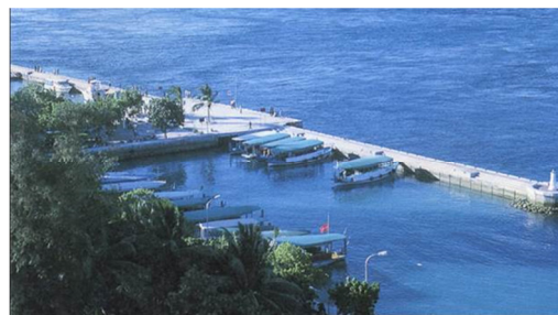
Visual Illustration of Seawall