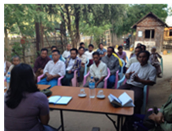
Preliminary survey (Myanmar)