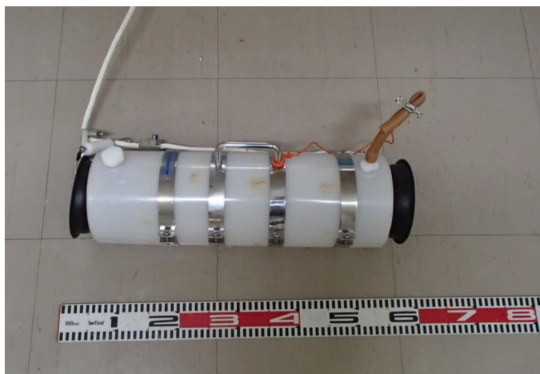
Figure 6. Van Dorn sampler