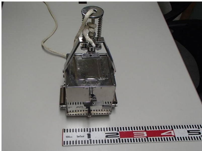
Figure 1. Ekman-Birge bottom sampler