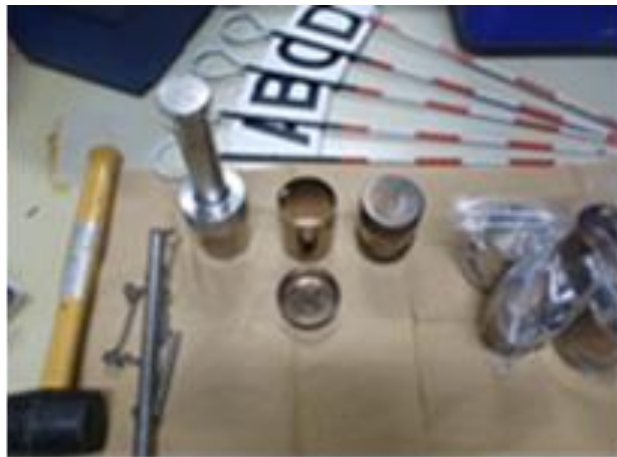
Figure 2. Soil sampler, etc.

Soil samples were not collected in the following cases: