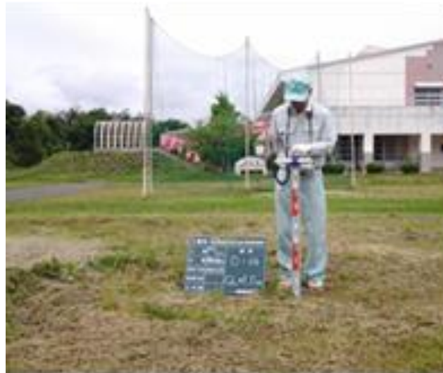
Figure 4. Measurement of ambient dose rates (example)

Measurement was conducted at a height of 1 m from the ground surface, while keeping the sensing station of the survey meter horizontal. The time constant was set at 30 seconds (10 seconds when the detected value was 0.1 \mu\text{Sv/h} or above). After holding the survey meter for a duration 5 times the time constant, readings were taken 5 times with intervals equivalent to the time constant. Ambient dose rate was obtained by multiplying the average of the readings by the calibration constant.