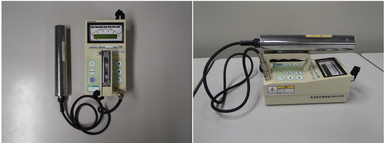
Figure 5. Survey meter