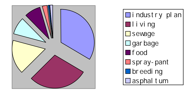
Figure 2 distribution and category of odor pollution source in TianJin9(2)

The distribution and category of odor pollution source in TianJin