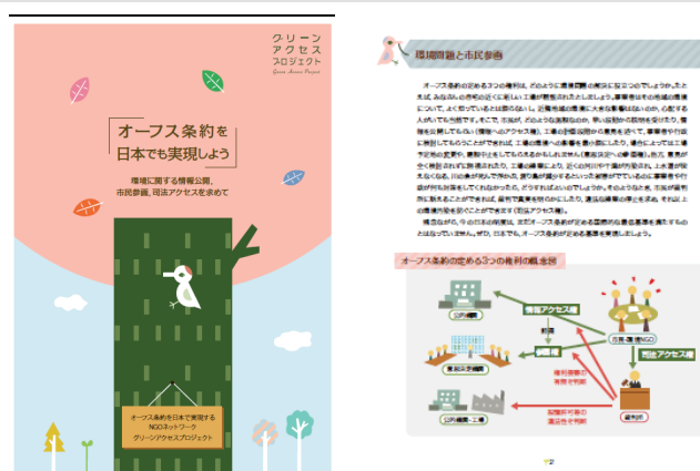
Figure 51 Pamphlet on the Aarhus Convention

Aarhus Net Japan has produced the pamphlet shown in Figure 1 and distributed copies of it as part of its information campaign.