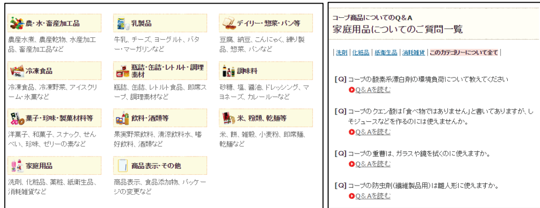
Figure 53 Q&A on Co-op brand products

This webpage answers questions that are frequently asked by consumer members on Co-op brand products. It is designed for easy access to the information consumers want to know. Questions and answers are shown, for example, under such headings as “most frequently asked questions at this time of year” and “most viewed questions.” They are also organized according to product category from a consumer perspective. For example, if you select the “household products” category, you will see Q&A on the uses of insect repellents and the environmental impact of oxygen bleach, among other topics.