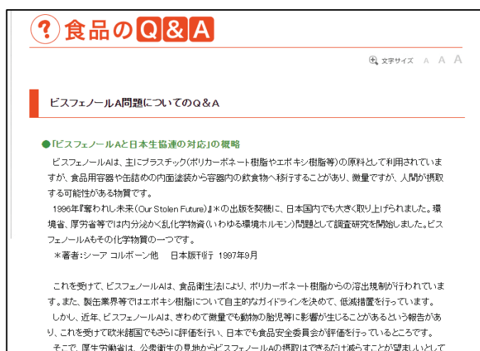
Figure 52 Q&A on the bisphenol A issue

This webpage provides information on chemical substances in food, food additives, and packaging. The information thus provided is classified by theme and issue. For each substance, the webpage explains a number of aspects--ranging from the uses, exposure pathway, and safety to the background to the substance having attracted social attention, as well as what consumers should be cautious about--in a way that is easy to understand for those with no special knowledge.