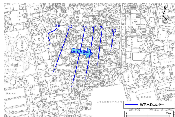
図 1-2 地下水の流れと地下水位等高線 春季：平成 27 年 5 月測定 (地下水位等高線の単位：標高 m)