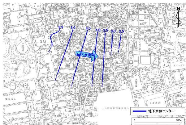
図1-4 地下水の流れと地下水位等高線 秋季：平成27年11月測定 (地下水位等高線の単位：標高m)