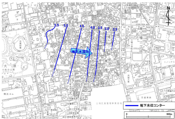
図1-3 地下水の流れと地下水位等高線 夏季：平成27年8月測定 (地下水位等高線の単位：標高m)