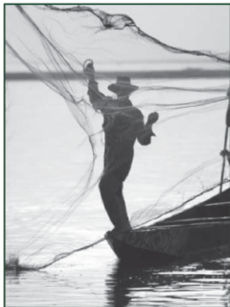
Benefits from ecosystems in Malt: Fishing in inner Niger delta.

The Decision-Maker's Tool (DM Tool) profiled at IAIA08 is designed to guide strategic environmental assessment (SEA) practitioners step-wise through a typical SEA process, using sustainability-focused questions that culminate in an effective Briefing Note for the Decision Maker (DM). The DM Tool can be used to guide the practitioner through the crucial step of presenting SEA findings in a consistent, relevant and usable form for the DM to determine the best way forward. SEA findings are usually presented to DMs in the form of a Briefing Note, and a well-crafted Briefing Note acts as a "translation tool" for the DM. The tool aims to translate a wide array of technical information and values into a language matching the culture familiar to the DM. The DM Tool is still in a draft phase, and the authors invite IAIA members to review and or test the tool in an actual SEA process. • For more information, contact: Robert Gibson ( rbgibson@envmail.uwaterloo.ca ), Peter Croal ( acdi-cida.gc.ca ), Charles Alton ( earthlink.net ), Susie Brownlie ( dbass@icon.co.za ), or Erin Windibank ( ewindiba@admmail.uwaterloo.ca )