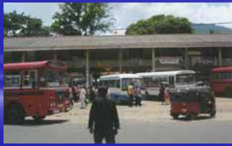
Matale City's Bus Holding Places

We all agree that transportation is very necessary for economic growth of any country. But balancing these needs with the need to protect the environment should be at the heart of the concept of environmentally sustainable transport.