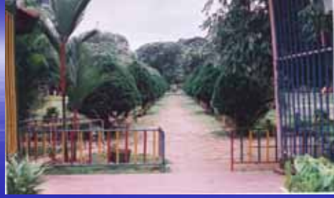
Kiddies Park run by the MMC