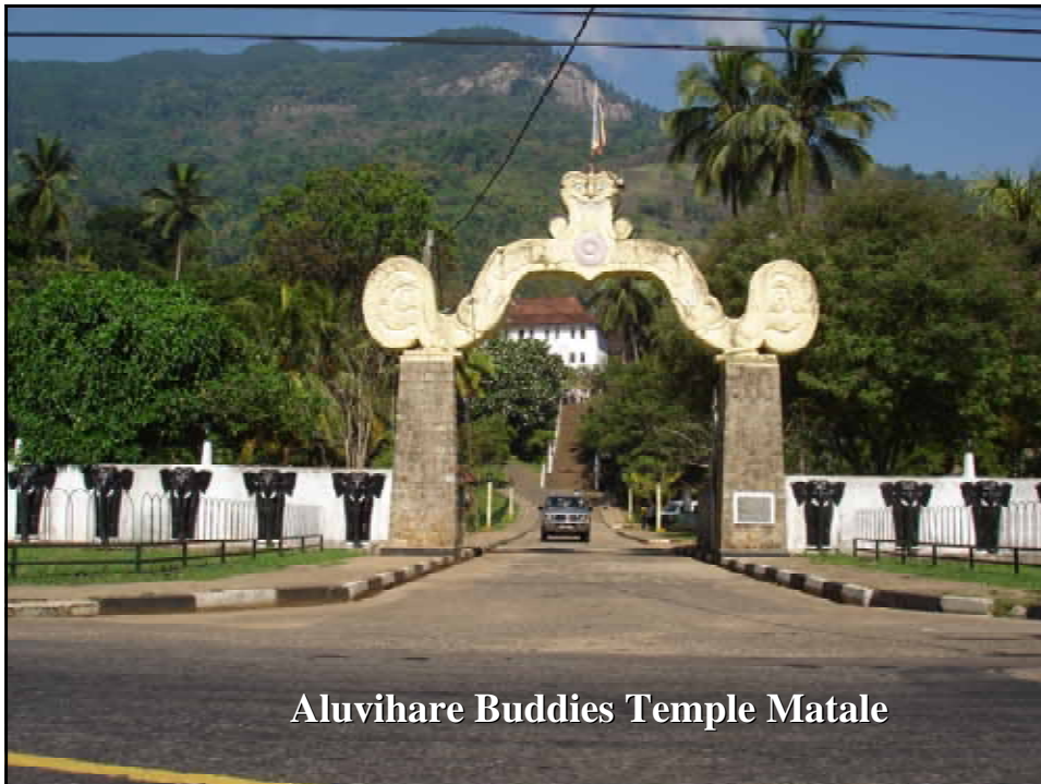
Aluvihare Buddies Temple Matale

The city of Matale is right in the middle of the hill country, surrounded by beautiful mountains and the longest river the Mahaweli flows through the central part of Matale district. To the north of Matale city - about 3 kilo meters - there is an ancient temple more then 2000 years old, where Buddhist scriptures were written on ola - leaves and this temple named Aluwihara Rajamaha Viharaya is world famous for its environmental friendly atmosphere. And to the further north, of Matale city is one of the eight wonders of the world, a rock - fortress named Sigiriya, built in the 5th century by king Kashyapa. This is the first planned city in the world with all facilities beautiful parks - city with large areas of woods and forest cover.