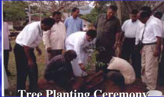
Tree Planting Ceremony

To beautify the city, we have planted trees and herbal plants in the public park and along the streets. A separate park for children too has been built with all modern facilities. A new programme was introduced to collect garbage in the city. But with little income that we collect from the taxpayers, we are unable to install a garbage - recycling plant. I would very much appreciate if any country or the Mayor of a city who will help us in this venture.