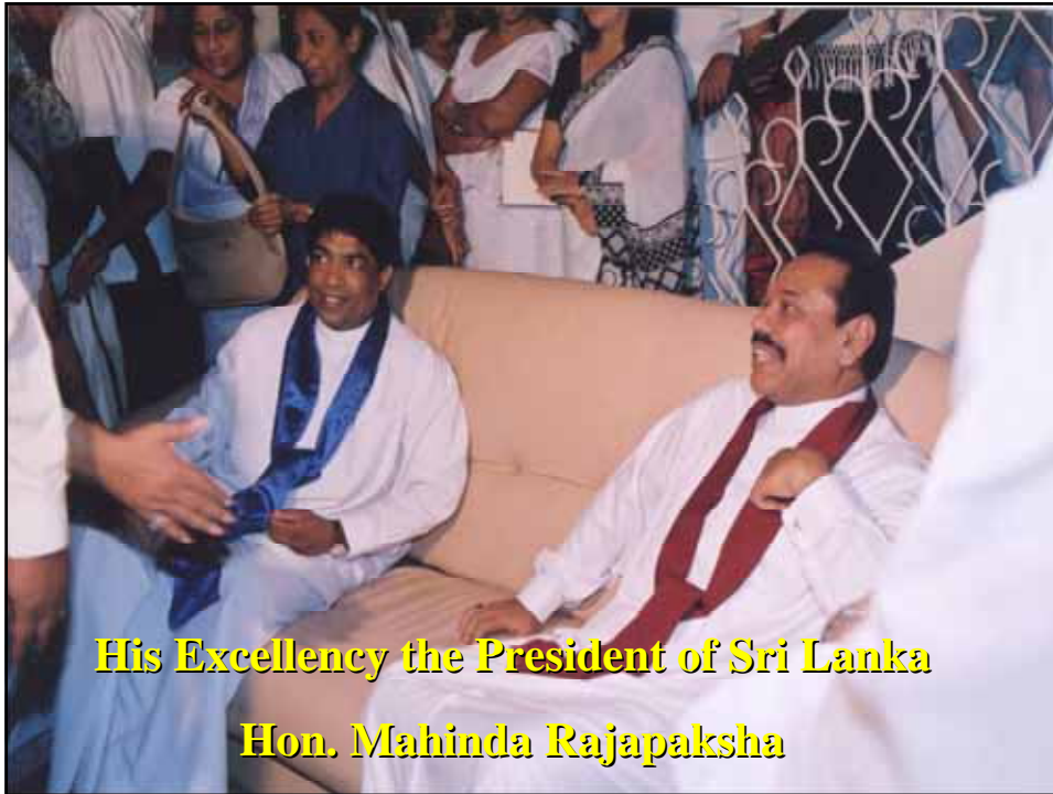
His Excellency the President of Sri Lanka Hon. Mahinda Rajapaksha

As the Minister of Urban Development, it is my bounded duty to help the city dwellers to live a contended, healthy life without being subjected to the pollution of environment and other problems that the developing third world countries face today.